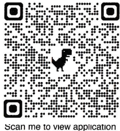
Scan me to view application